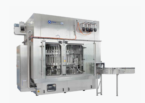
Hema Volufill Filler for jam